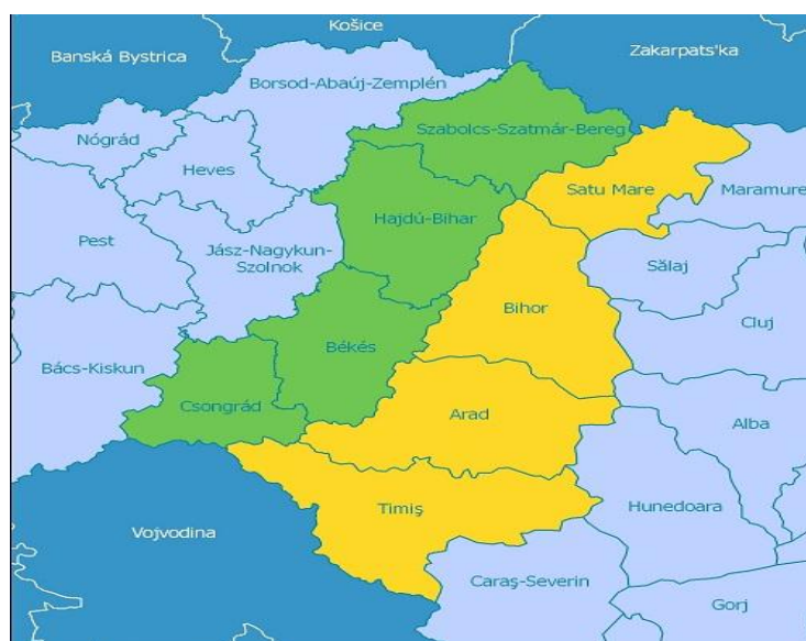
Map no. 3: The eligible area of the Romanian-Hungarian Cross Border Cooperation Programme

The border between Romania and Hungary has a total length of 448 km, of which 415.9 km land and 32.1 km river (the Mures, Cris, Someş rivers) 18 . On the Romanian side there are four counties, Satu Mare, Bihor, Arad and Timiş, and on the Hungarian side there are Szabolcs-Szatmár-Bereg, Hajdú-Bihar, Békés and Csongrád. All the 8 counties are classified as NUTS III and are integrated in 4 regions of level NUTS II 19 . The Romanian-Hungarian Border covers the South-Eastern and Eastern part of Hungary and the North-Western and Western part of Romania. The eight counties have a total surface of 50,454 km 2 , of which 43.7% Hungarian and 56.3% Romanian area. The Hungarian territory is 23.7% of the total surface of Hungary, and the Romanian part is 11.9% of Romania. The total population in 2004 was more than 4 million, of which slightly less than half lives in Hungary, and slightly more than half lives in Romania 20 .