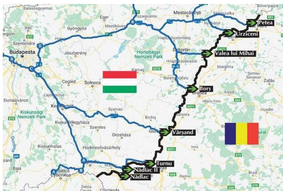
Map no. 2: Open border crossing points for road traffic at the Romanian-Hungarian border

In the process of EU-integration the Hungarian-Romanian state border is becoming even more permeable as well. Despite the fact, that Romania is not member of the Schengen Agreement, crossing the borderline between the two neighbouring countries is much easier than a few years earlier. The growing permeability of the European borders contributes to the unification of the economic potentials of the neighbouring areas supplying benefits on regional and local level.